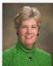
BARBARA LEE NATIONAL FARM MEDICINE CENTER AT-LARGE-2021